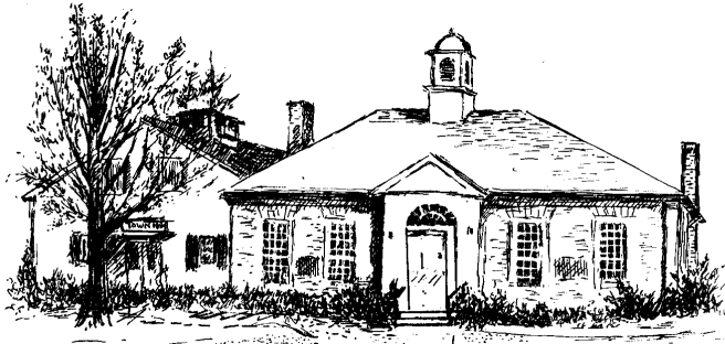
Mansfield Town Hall, Built in 1843